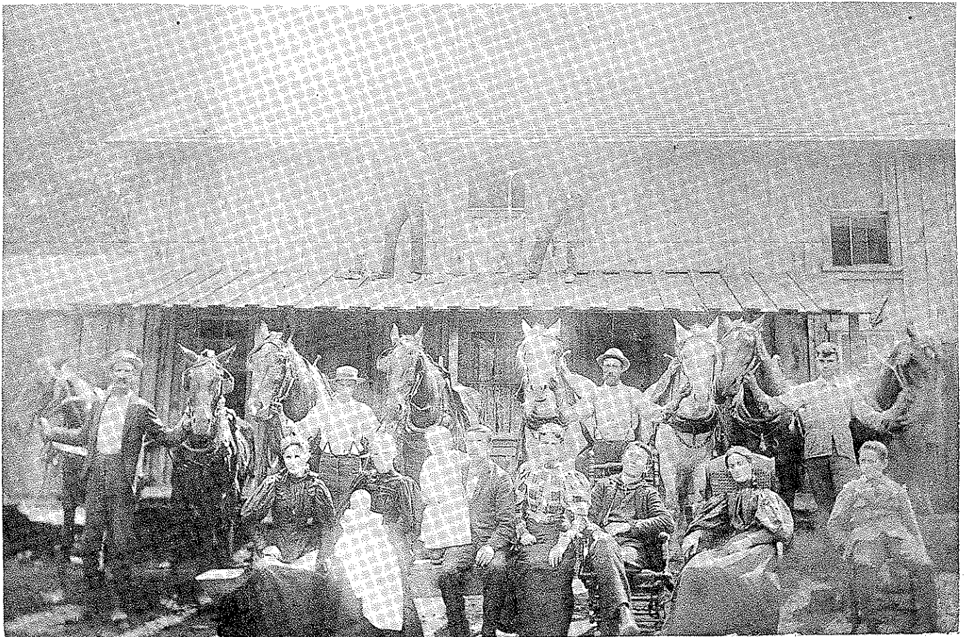
At the age of sixteen, a teamster in a logging camp.